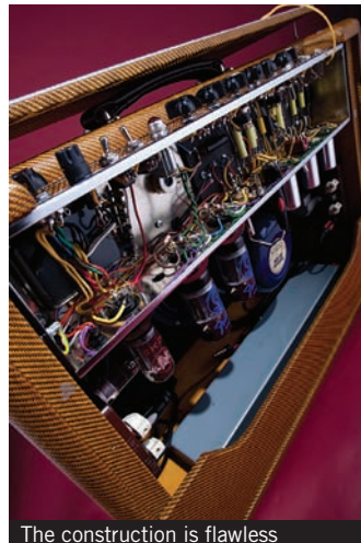
The construction is flawless

Likewise with the bright channel, but here we end up with the channels linked together for our favourite tones. The tone controls are highly interactive, so spending some time getting to know how