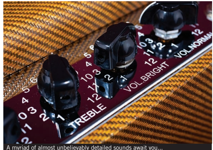
A myriad of almost unbelievably detailed sounds await you...

Turning up the volume gets the output stage working and rewards us with a rich, naturally compressed overdrive. The Tayden speaker sounds superb in this application, unlike many speakers that would seem a natural fit with