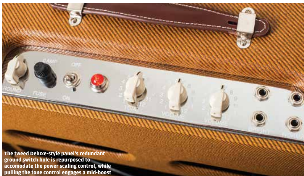
The tweed Deluxe-style panel's redundant ground switch hole is repurposed to accommodate the power scaling control, while pulling the tone control engages a mid-boost